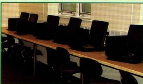
New ICT Suite

We are pleased to welcome Mr Winder to the Department in September.