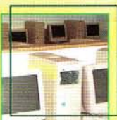
Pg:2 – New computer aided design centre