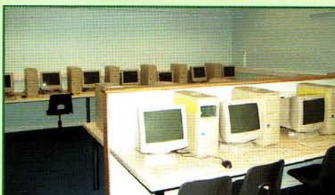
Computer Aided Design Centre