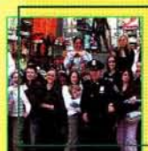
Pg:3 – New York New York