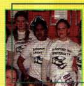
Pg:3 – Passport to University