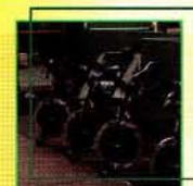
Pg:4 – Keeping fit